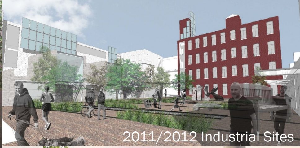
2011/2012 Industrial Sites