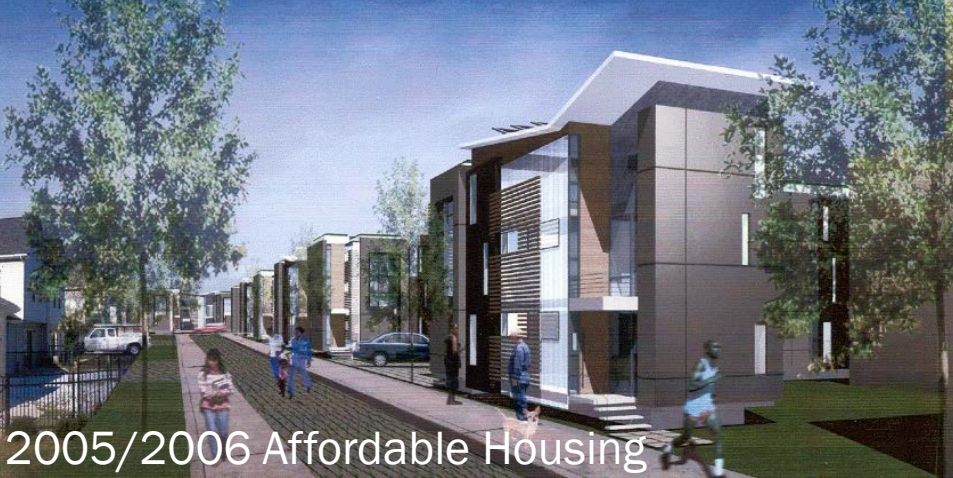
2005/2006 Affordable Housing