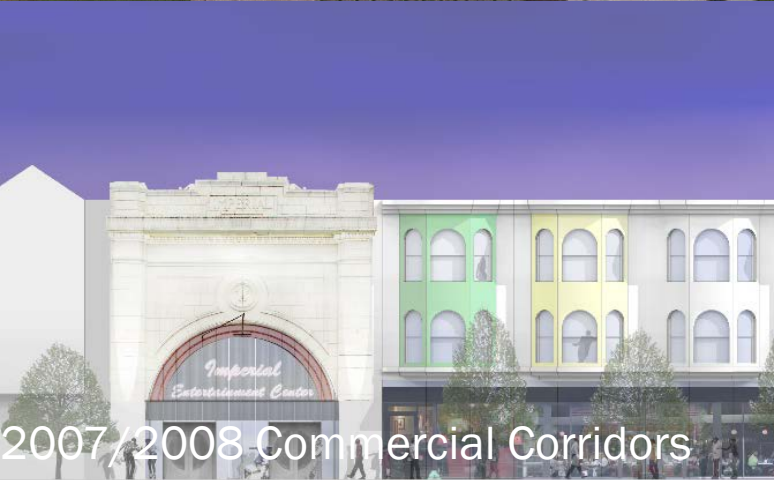
2007/2008 Commercial Corridors