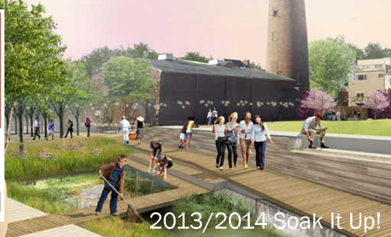
2013/2014 Soak It Up!