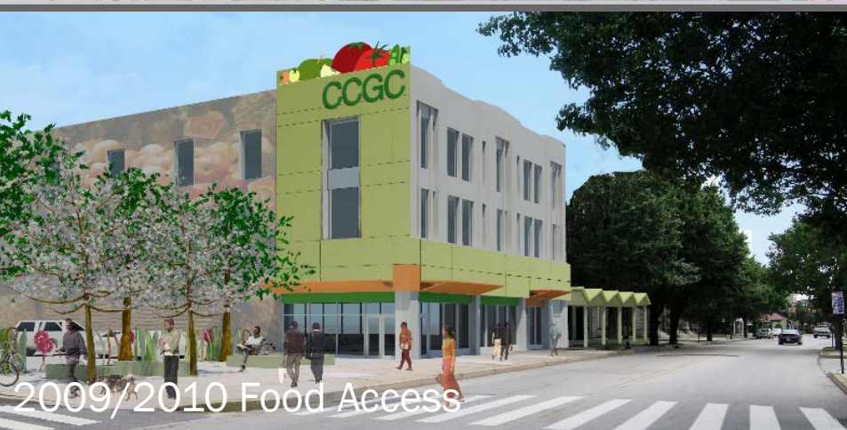
2009/2010 Food Access